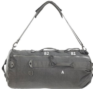
MEDIUM 1 USE HANDLE B1/B2 2 HOOK STRAP ONTO SHOWN D-RINGS