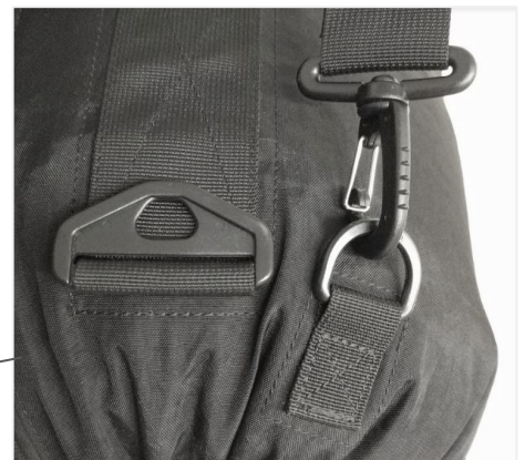
ATTACHES TO OUTER SMALL D-RING