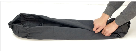
1 FOLD + ROLL