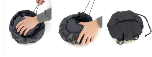
2 CINCH INTO A BALL