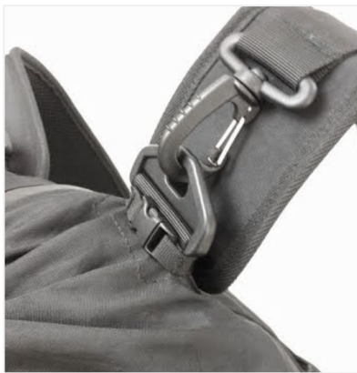
1 MAIN CLIP ATTACHES ONTO D-RING 2 SMALL SNAP HOOKS ATTACH AROUND THE BASE OF THE LARGE D-RING