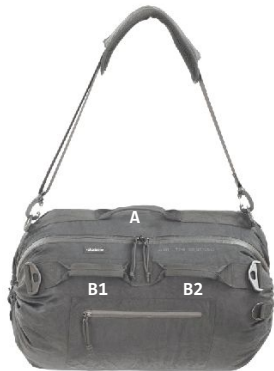
SMALL 1 USE HANDLE A 2 HOOK STRAP ONTO SHOWN D-RINGS