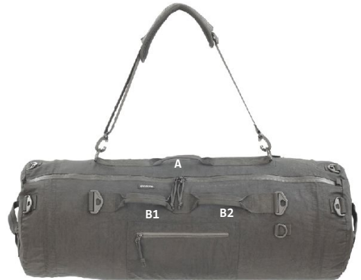
LARGE 1 USE HANDLE A 2 HOOK STRAP ONTO SHOWN D-RINGS