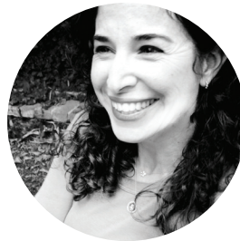
PlanetJill Monogram Photo Locket

This Grommet is a customized product made to order just for you. We're working on your Monogram Photo Locket right now, and production takes several days. We're sure you'll love it when it arrives.